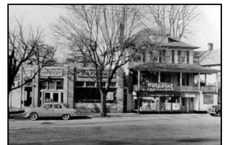
Safeway on Howard Ave., c. 1940s