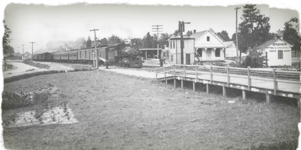
View from the Station - Mizell's still looks the same!

The Society meets Tuesday, March 10, 2009, at the Kensington Town Hall/ Armory building, 3710 Mitchell St. Our meeting begins at 7 p.m. with coffee, hot cider and cookies, followed by the program at 7:30 p.m., concluding with a brief business meeting. The public is always welcome at our meetings - please join us!