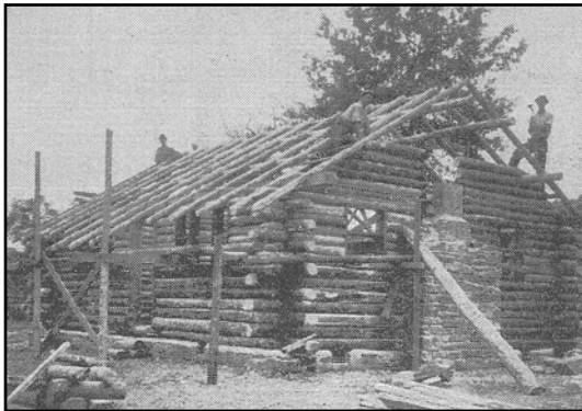
Kensington Cabin 1934