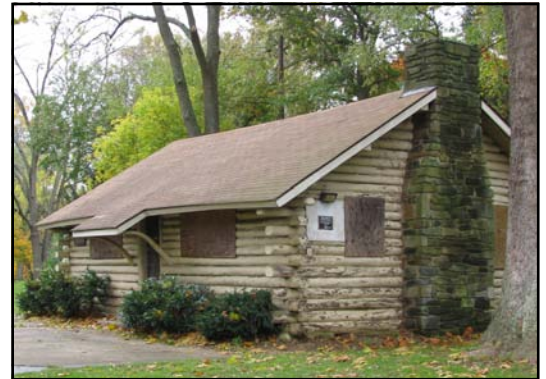
Kensington Cabin 2009