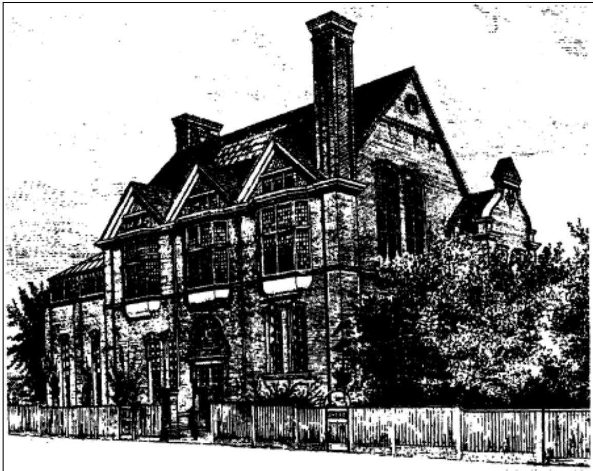
Figure 3: Studio House for Marcus Stone, Kensington, England by Norman Shaw.

a population of seventy. The construction of the railroad in the 1870s, and the opening of a stop known as Knowles Station after the Knowles' family landholdings, began the transformation from a small crossroads to an important mail and passenger stop. In 1890, large tracts of land owned by Brainard Warner a noted Washingtonian, south of the railroad were subdivided. Warner's subdivisions were modeled after Victorian suburbs in England, like Kensington, with ample sized lots and a curvilinear street pattern.