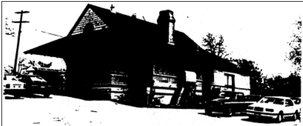
Figure 4: Illustration of Kensington Railroad Station.

The Kensington Railroad station was designed in 1891 by the noted Baltimore architect E. Francis Baldwin. Baldwin’s stations reflect the influence of Henry Hobson Richardson, and the shingle style of architecture. The Kensington Station is a good example of the style. The building is anchored by its over-hanging gambrel roof that emphasizes the building’s horizontality. The shingled roof and siding, and the earth tones heighten the sense of rusticity.