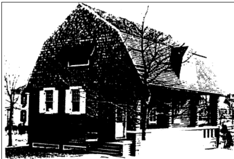
Figure 5: Historic Photograph of Noyes Library, undated.

The town consists of 304 acres and contains a library, schools, small industries, a town hall, churches, a World War II memorial, residences, and a complex of antique shops. The Kensington Historic District retains much of its late 19th century suburban appeal in well-preserved Victorian styled residences with picturesque streets and gardens.