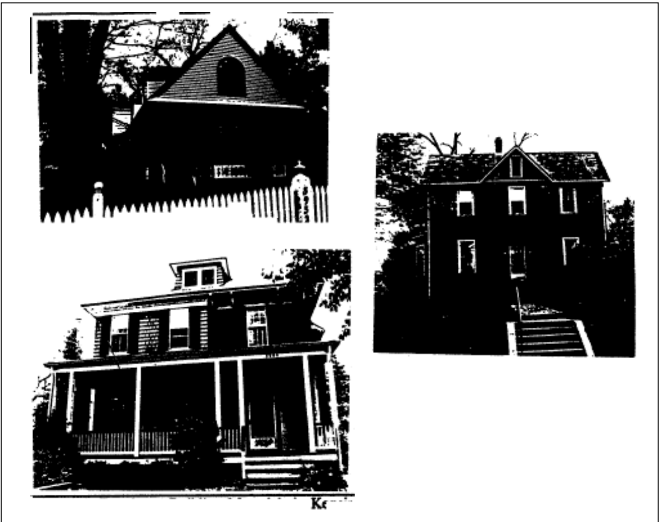
Figure 14: Dominant Building Materials in Kensington: Clapboard and Brick.

The dominant building material in Kensington is wood, executed either as clapboard and weatherboard. Thirty-five percent of the historic structures in Kensington are clad in wood, and retain much of their original wood trim. Additionally, 11% of the structures are clad with wood shingles, typical of the Shingle and Queen Anne styles. A large number of historic resources have been clad with new building materials, and have lost much of their exuberant detailing and ornamentation. 22% percent have been clad in aluminum or asphalt siding. Sixteen brick structures are located in Kensington, or 11% percent of the historic resources are brick. Eight stucco buildings are located in the district, comprising 5% of the residential building fabric.